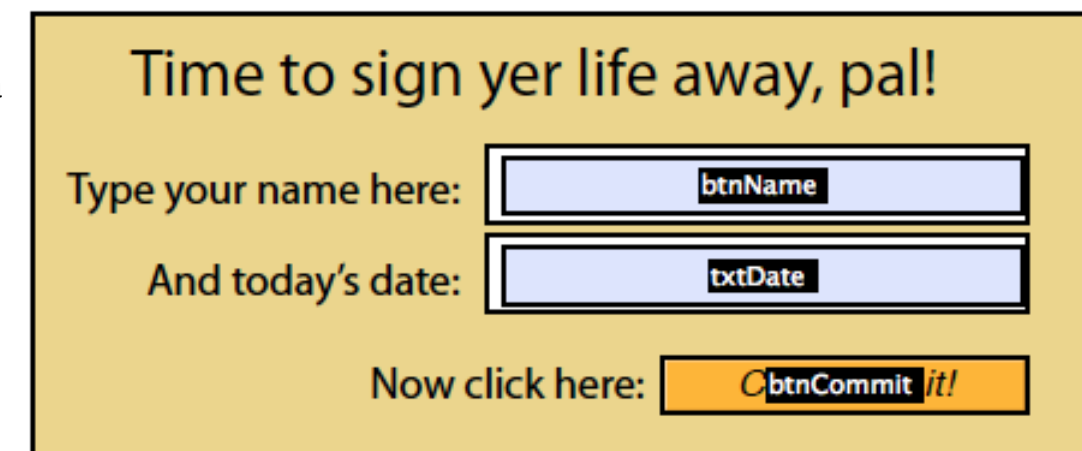
Figure 1. Our

I'm assuming you know how to attach a JavaScript to the Mouse Up event of a button. If not, check out the references listed in the "Fuller Scoop" sidebar on the previous page.